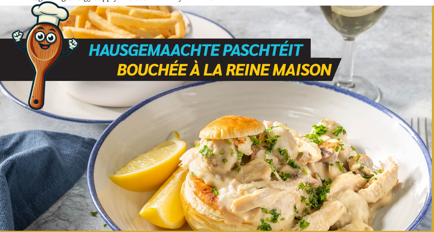
Den 9. Februar invitéiert #teamkielen op eng Paschtéit mat lokale Produiten. Animatioune fir Kanner.

Le 9 février, #teamkielen organise une Bouchée à la Reine à base de produits locaux. Animations pour enfants.